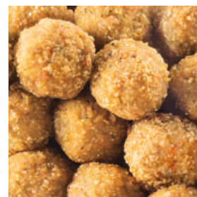
High - Protein Veggie Tots with Pumpkin and Carrots