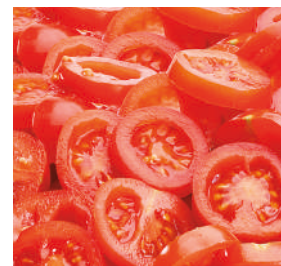
Cherry Tomato Slices