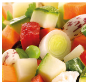
Minestrone 13 Vegetables