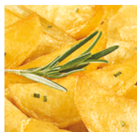
Potato Wedges Seasoned and Grilled