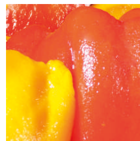
Roasted Peeled Peppers

In order to satisfy everyone that is looking for an even more healthy and balanced cuisine, Orogel Food Service has created a Wellness line : vegetables, pulses and cereals in a large range of delicious and rich of natural properties recipes . Perfect for side dishes or as basic ingredients for main courses.