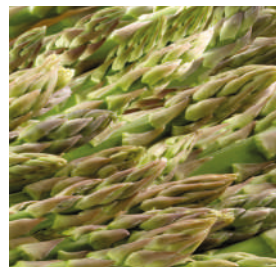
Mini Asparagus Tips