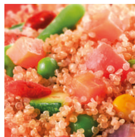
Quinoa with Vegetables and Goji Berries