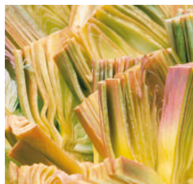
Artichoke Hearts (Slices)