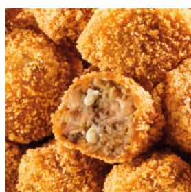
Breaded Veggie Tots with Aubergine and Scamorza "Dorantine"