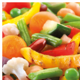
Ethnic Vegetables Mix