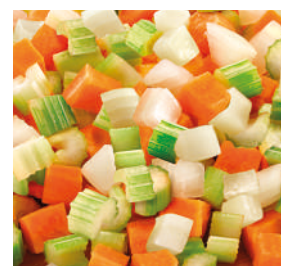
Soffritto Mix (Onion, Celery, Carrots)