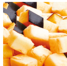
Aubergines Dices Pre-Fried