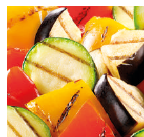
Grilled Vegetable Trio