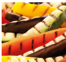
Grilled Vegetable Trio in Sticks