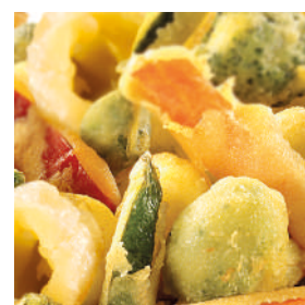
Battered Vegetables Mix with Onion