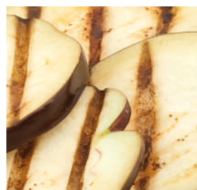
Grilled Aubergine Slices