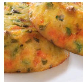
Mini Flan with Potatoes and Turmeric