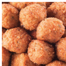
High - Protein Veggie Tots with Tomatoes