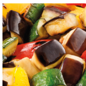
Pre-Fried Mediterranean Trio