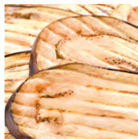
Aubergine Slices for "Parmigiana"